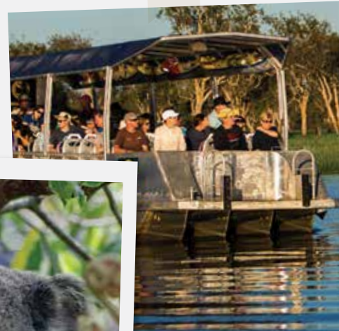
Cruise with crocodiles in the top-end

All holidays are quality reviewed and sourced from accredited tourism suppliers who practice high ethical standards.