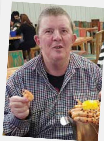
Sea food fresh from the boat in Cervantes, WA