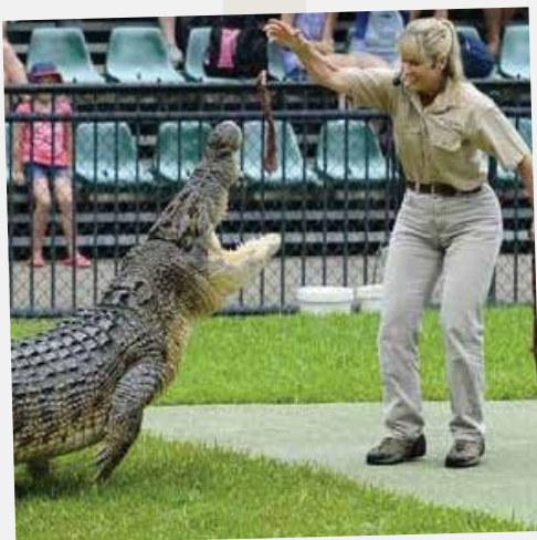
Front row seats to catch all the action at Australia Zoo