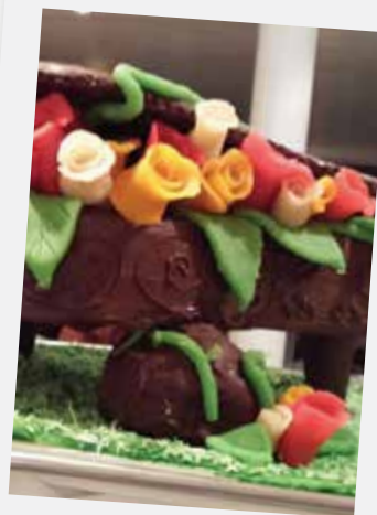
Try a one of a kind chocolate cake