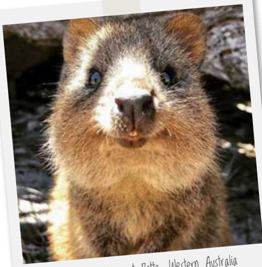
Meet the local quokkas at Rotto, Western Australia

There is something for everyone in our range of local, interstate and international supported holidays and itineraries. Group travellers can select from upcoming departures or join other travellers registering their interest in different destinations and our flexible ANYTIME holidays.