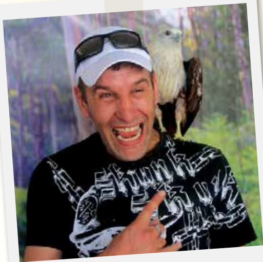
Meeting the locals at the Bali Bird Park