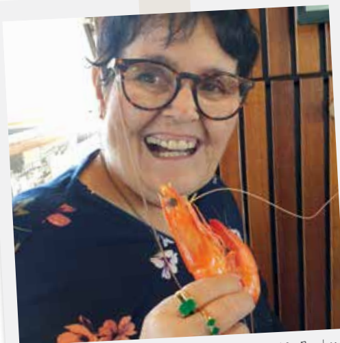
Enjoy a seafood feast, at the Four Winds 360 Revolving Restaurant, Surfers Paradise

Here's why Discovery Holidays are THE BEST when it comes to offering our guests choices they deserve.