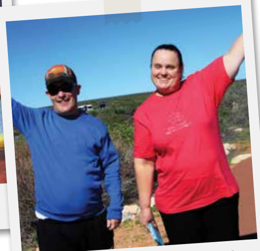
Exploring the coast with Mates is great summer fun, Pinnacles WA