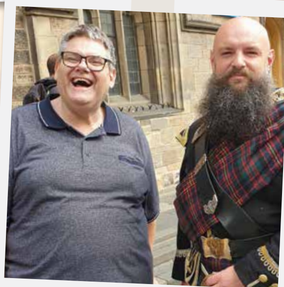
Brain enjoying a laugh with the locals in Edinburgh