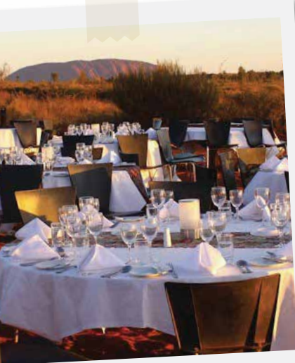
Uluru Sunset Dinner