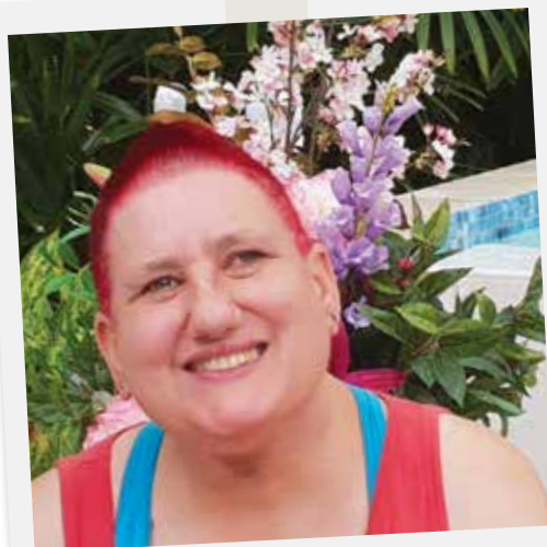
Roxy rates it ★★★★★★★★★★ stars she had a brilliant time at the Gold Coast Theme Parks

For further descriptions and guidance, please visit our website at discoveryholidays.com.au