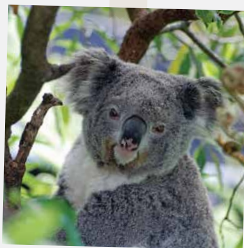
Up close with Koalas at Phillip Island Conservation Park