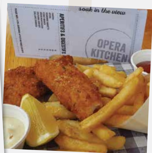
Enjoy famous fish and chips at the Sydney Opera House