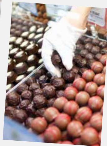
Visit the Margaret River Chocolate Factory

All menu and food options can be modified to guests’ specific requirements before or during travel, by agreement with venues or with our own equipment.