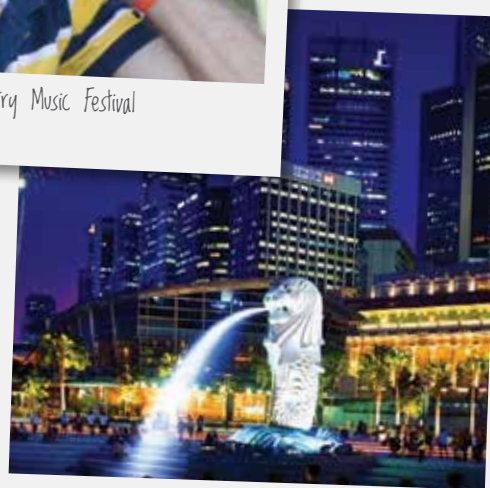
Singapore - City of Lights