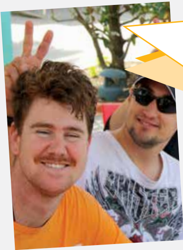
Movie World Fun 7 day Gold Coast Theme Parks