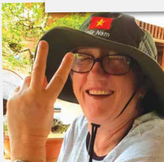
Karen breakfast Ho Chi Minh Style

“ My holiday to Scotland was perfect, we had great seats and I saw everything. There was great food plus I could choose anything I wanted to eat. My guide was so much fun and looked after everything. I rate Discovery Holidays 5 stars ”