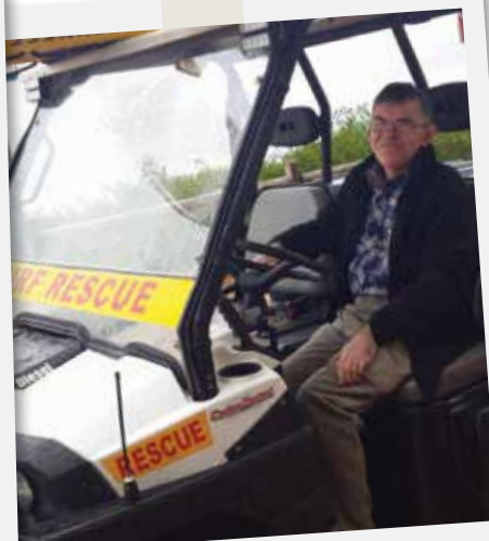
Behind the scenes on our VIP Home and Away Tour