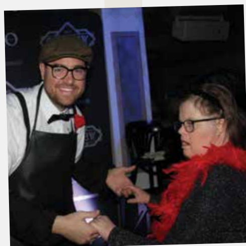
Dancing up a storm at The Gatsby Party on Sun Princess in the Whitsunday's

Each of our wildlife attractions have been carefully selected based on their environmental sustainability and their reputation for delivering exceptional guest experiences.