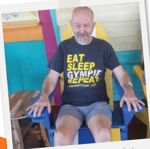
Relaxing at THE PUB Aussie World Sunshine Coast