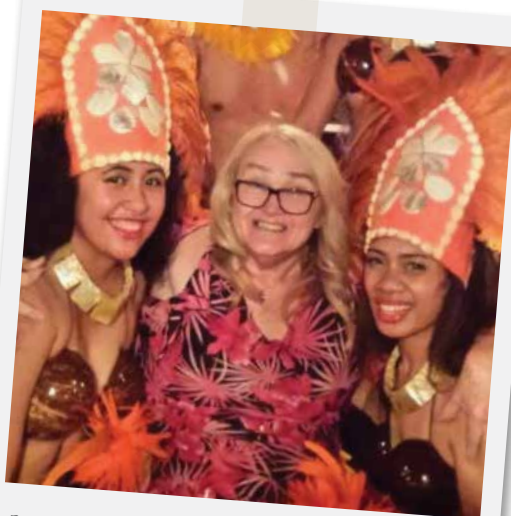
Riverboat Magic - Brisbane 7 Day City Explorer