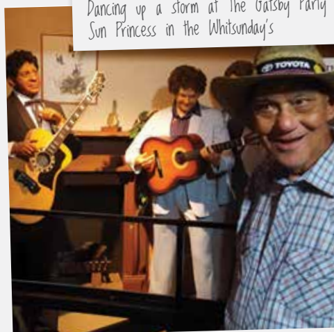
MEETING THE LEGENDS Tamworth Country Music Museum